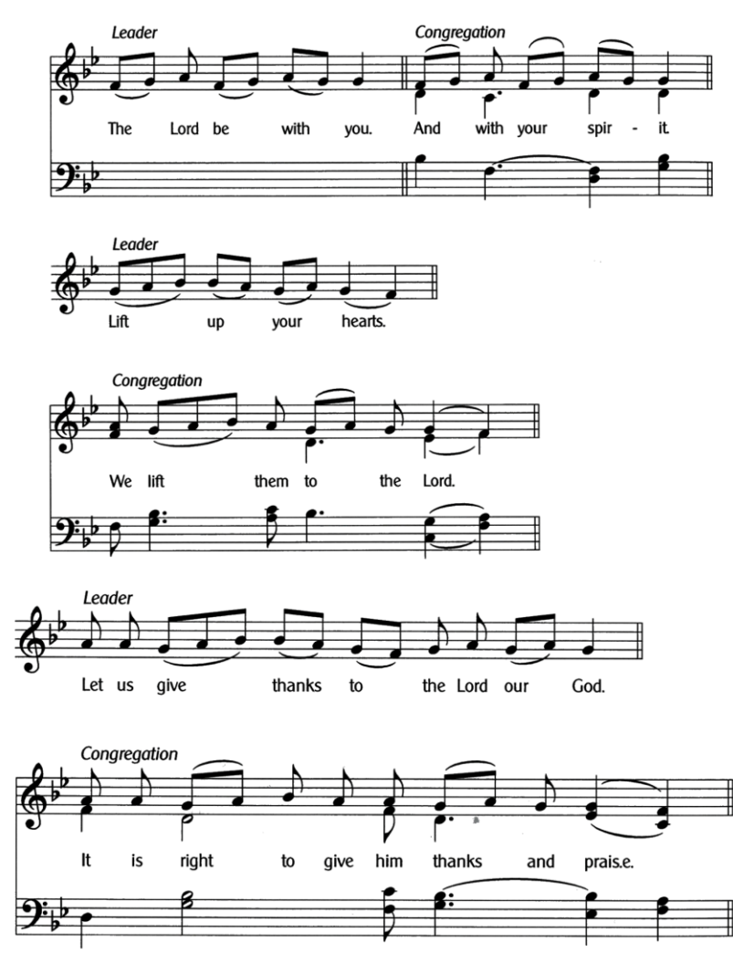
Proper Preface (88)