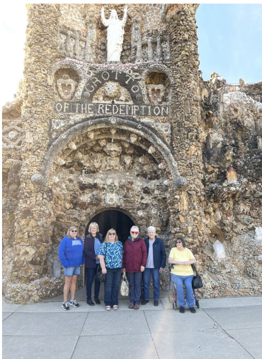
Women’s Retreat to the Grotto of the Redemption in West Bend, IA and the Amana Colonies.