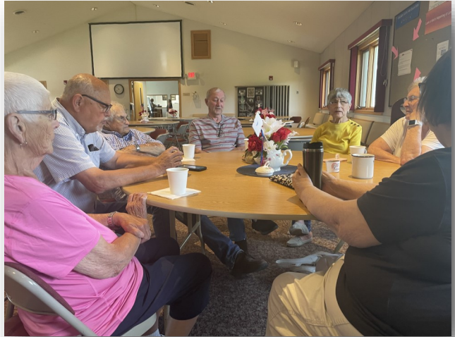
Every Tuesday at 9:30am Fellowship Café participants gather for coffee, treats, and good company.